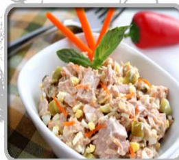
Gourmet Tuna Salad