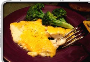
Baked Fish Au Gratin

Makes 4 servings. Per Serving: Calories 264 Protein 26 g Fat 11 g Carbs 5 g Sugar 0 g Sodium 325 mg